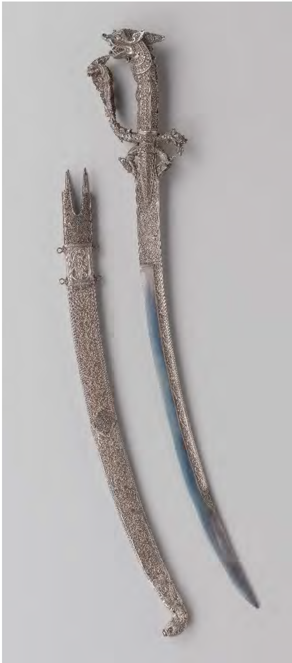
Rijksmuseum, Amsterdam, inv.no. NG-NM-7112

In collaboration with Senarath Wickramasinghe (National Museum, Colombo)