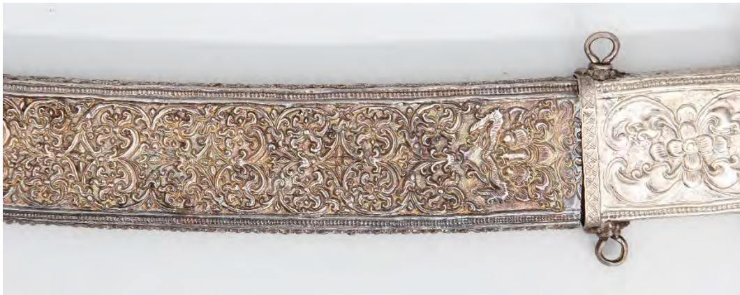
Photos 5 and 6: Details of the scabbard. Notice how the kibihi-muna (lion face) is used as starting point of the flower pattern. (Rijksmuseum, Amsterdam, inv.no. NG-NM-7112).

Based on the exceptionally fine silverwork, it is concluded that the silver kasthāné was made in the Four Workshops of the Kandyan King. Kasthāné produced in the royal workshop were all of high quality, yet the exact quality in terms of design, decoration, and material of the kasthāné signified the rank to whom the object was gifted: the more decorated (i.e. use of figures, gems, silver, gold), the higher the rank of the receiver. 20 The object analysis does not provide us with further evidence about the intended owner of the kasthāné , except that the exquisite use of silver and gems suggests it was exclusively made for one of the adigars , or other members of the highest aristocracy at the court. 21